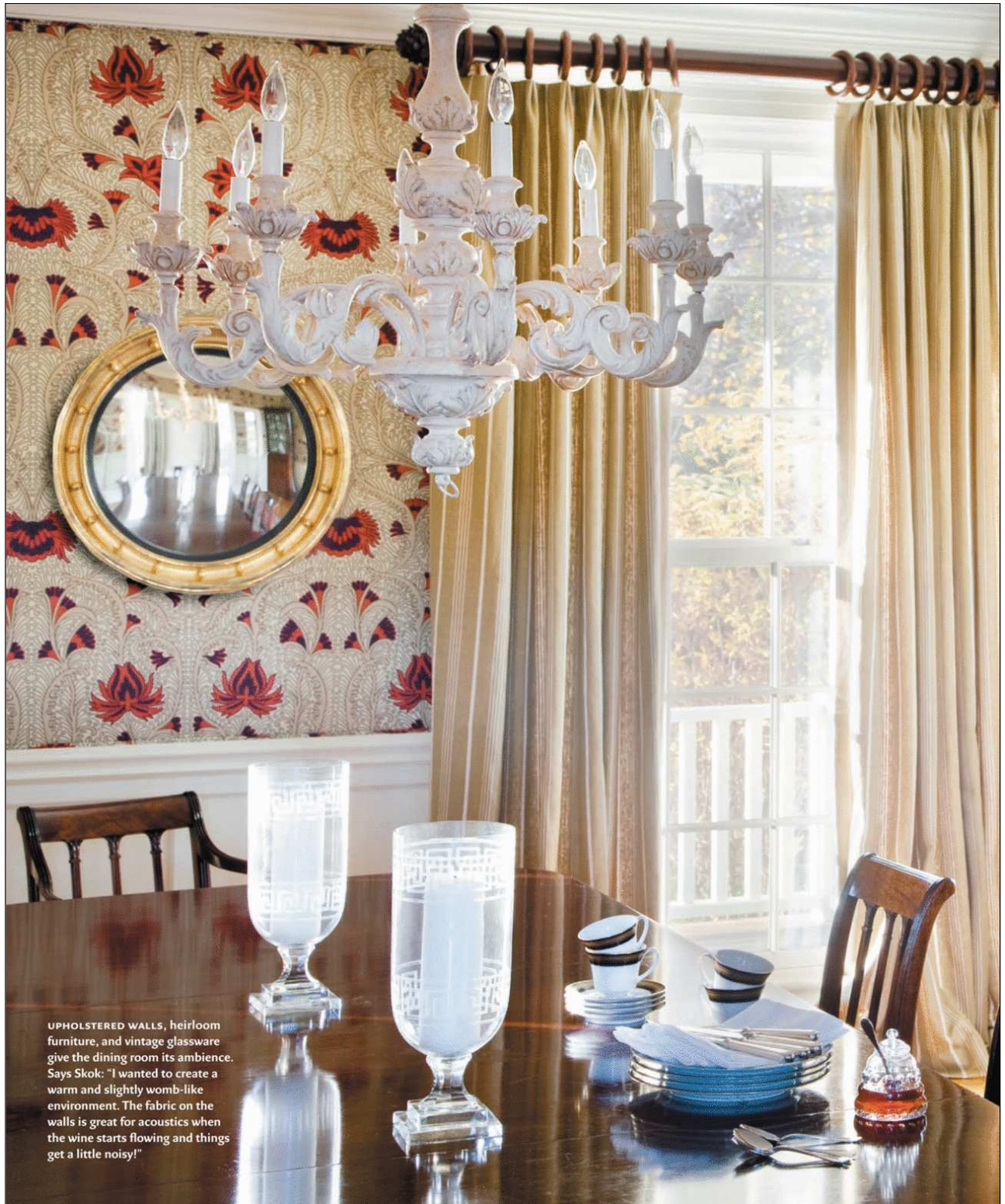
UPHOLSTERED WALLS, heirloom furniture, and vintage glassware give the dining room its ambience. Says Skok: "I wanted to create a warm and slightly womb-like environment. The fabric on the walls is great for acoustics when the wine starts flowing and things get a little noisy!"